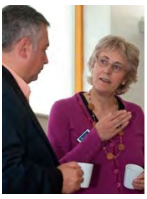
Delegates have lots of opportunity to interact in a manner with which they are personally comfortable.